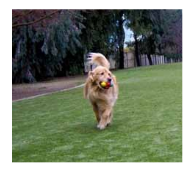
"Our new artificial lawn helps keep the dogs and the facility clean and the yard will be better for people in wheelchairs to use when practicing with their dogs. We are so thankful to have this big improvement."

Many retirement communities use extensive amounts of synthetic turf for landscaping to assist residents with mobility challenges. People using wheelchairs, canes or walkers can easily move across the turf. Because they are easy to maintain, synthetic turf surfaces also offer seniors the beauty of a decorative lawn without the expense, labor and time of weekly yard work during much of the year.