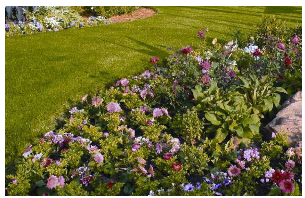
Pixie Hollow Fairy Garden, 2011 Epcot International Flower and Garden Festival, Disney World, Orlando, Florida